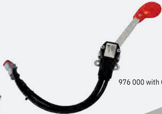
976 000 with CAN module