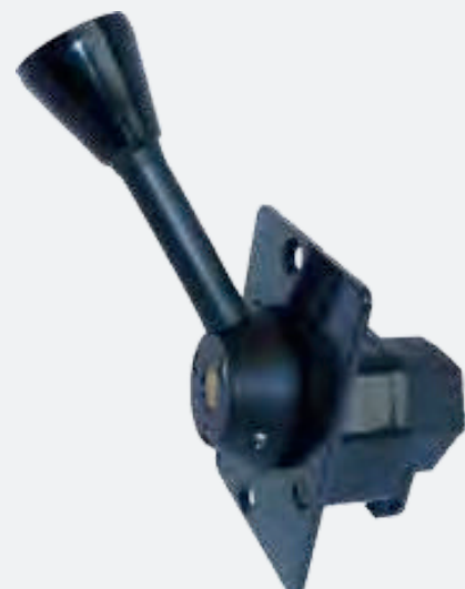
with inclined lever