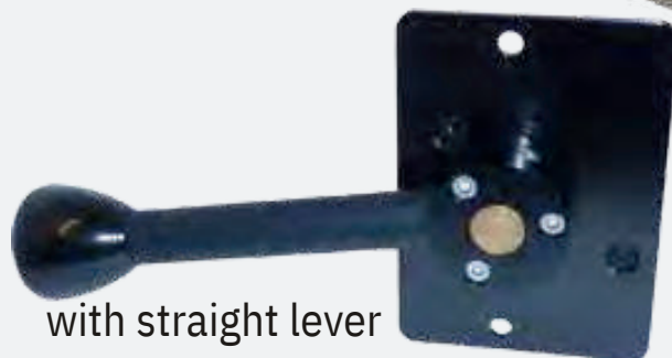
with straight lever