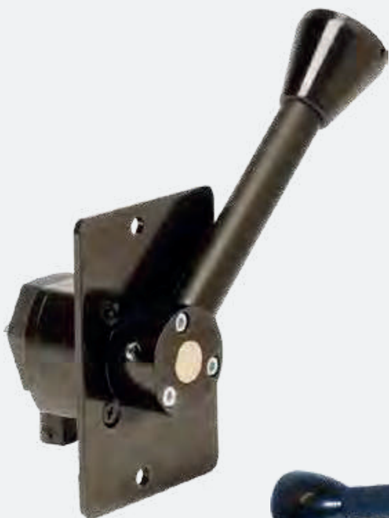
975 000 series - Side mounted