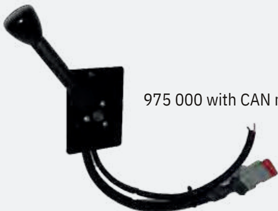
975 000 with CAN module